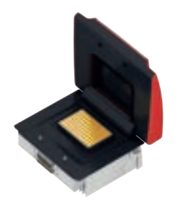
96-well silver-block module

For highest demands in speed and uniformity