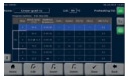
Spreadsheat programming interface

All fields for the input of program parameters are shown in one single screen. One touch leads from the easy spreadsheet to the alternative graphical programming mode.