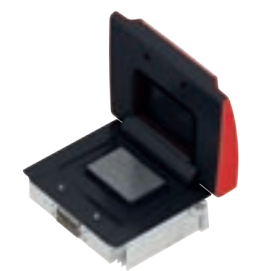
384-well aluminum-block module

For very high reaction volumes in 0.5 ml tubes