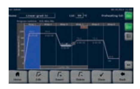
Graphical programming interface

Users are always on the safe side: On a regular basis or based on individual need, an extended self-test can be carried out to check all relevant features such as cooler, heating, cooling rates and more. All results are stored in a report and can be shared with the technical service.